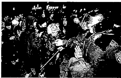
Police try to separate clashing pro-Russia demonstrators and supporters of the new Ukrainian government in Donetsk, Ukraine.

Let's all hear from you. letshereview.com | 217-421-4775